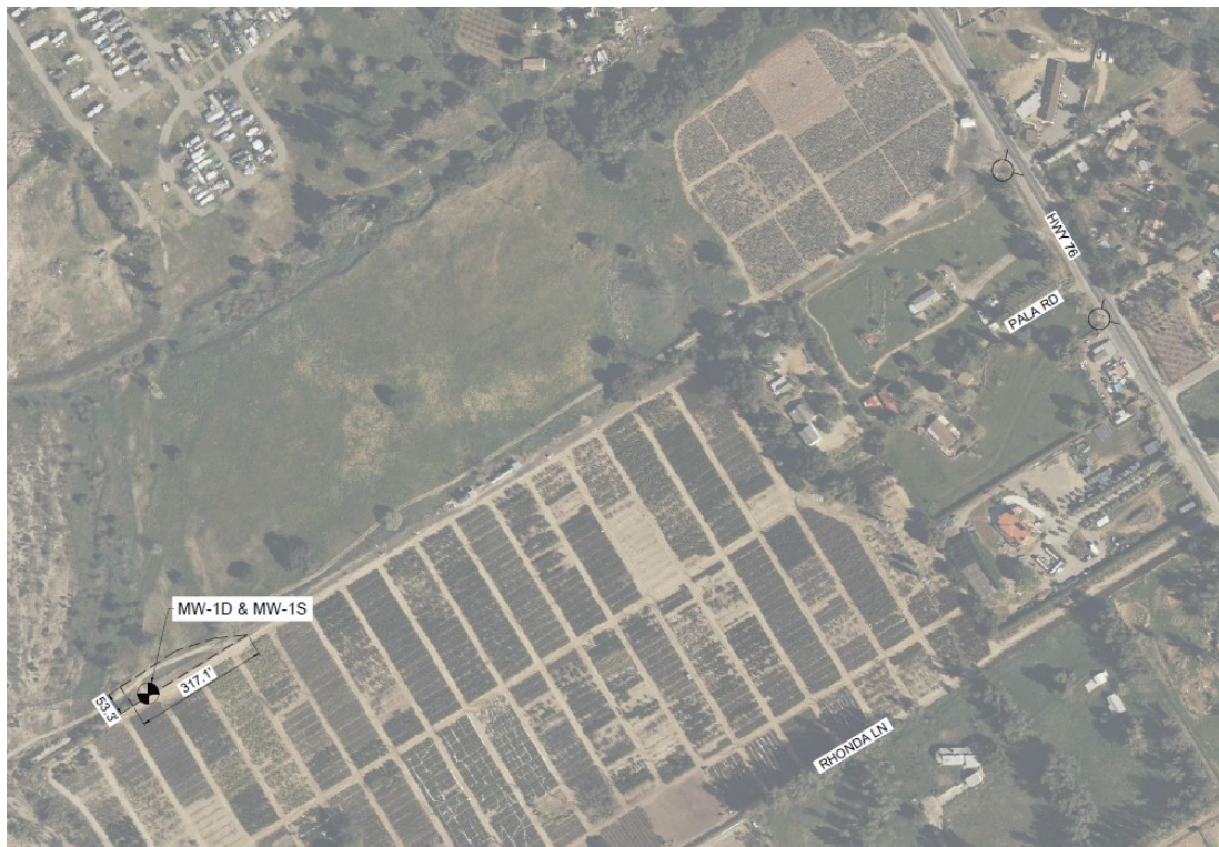
Figure 1 - Monitoring Well Location

Figure 1 depicts the location of the proposed monitoring well, which will be located within an existing disturbed dirt access road adjacent to agricultural areas. This monitoring well will be constructed as part of the ongoing efforts of the Upper San Luis Rey Groundwater Management Authority to help fill data gaps within the basin – therefore increasing hydrogeologic understanding and providing important information on specific conditions for Groundwater Sustainability Plan monitoring and reporting. The monitoring well will be installed using typical municipal well drilling methods. The well will be “developed” (following installation, relatively small quantities of residual groundwater and drill spoils will be pumped out and hauled off in trucks). Following well installation and development, no groundwater will be pumped for water supply. The well will monitor fluctuations in groundwater levels for the purpose of better understanding surface water and groundwater interactions. The well is anticipated to remain in place for ongoing seasonal monitoring.